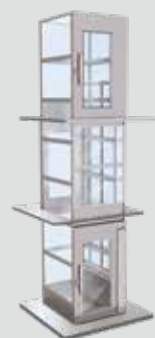
2. Open-through (3 stops)