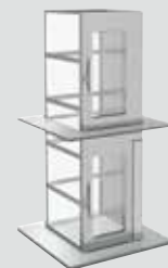
1. Single entry (2 stops)