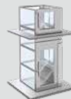
1. Single entry (2 steps)