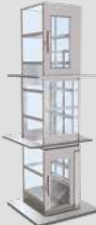
3. Open-through (3 steps)