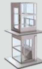
2. Adjacent (3 steps)